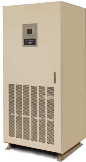
Reliable Power for Enterprise

Mitsubishi Electric's years of expertise in the manufacturing and control of power electronics creates a UPS design that maximizes efficiency across all load ranges while reducing the footprint and waste heat generated by the system. Mitsubishi Electric delivers the highest reliability among backup power equipment suppliers with an industry leading 15 year capacitor life and industrial grade fans. This combination of technology and reliability allows Mitsubishi Electric to deliver a UPS that can reduce a customer's operating expenses while avoiding costly downtime.